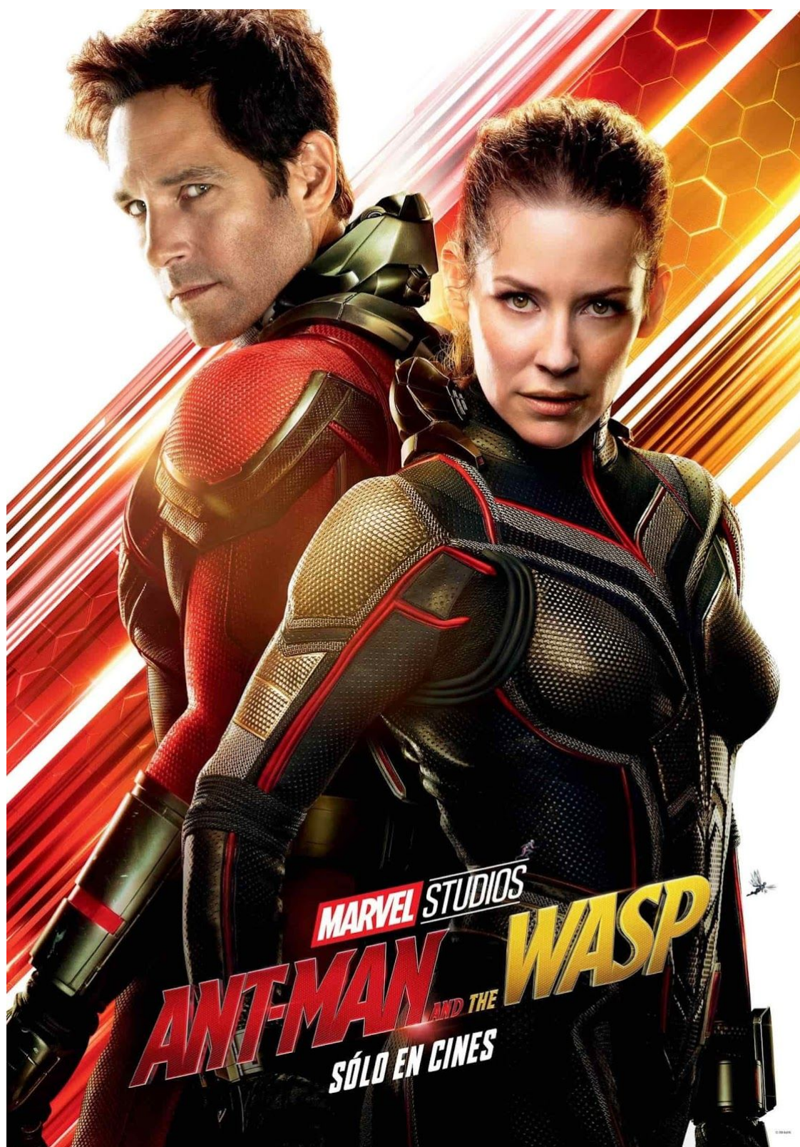
This is an American shot, too. Ant-man and the Wasp