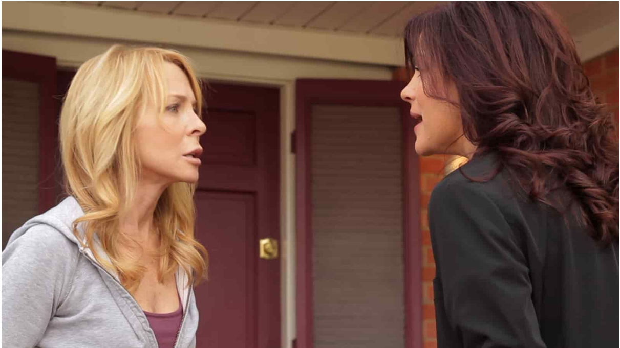
The two shot began in Soap Operas.

This helped directors immensely. They could showcase character reactions, and the scandalous reveals, all in one shot. The shot became more and more commonplace and eventually left television screens for the glitz and glamour of film.