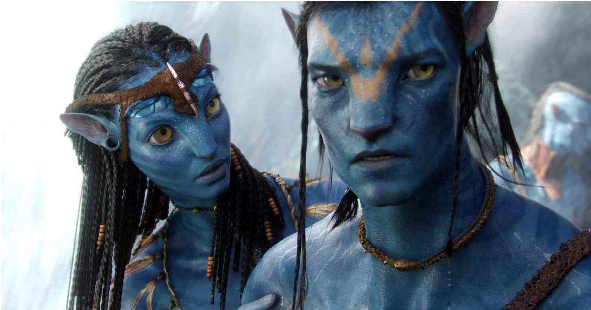
James Cameron using the two shot for Avatar (2009).